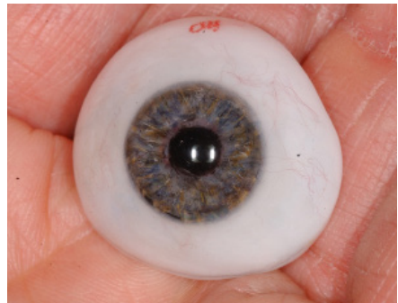
Example of an ocular prosthesis

Enucleation is a method of removing the entire eyeball. The eyelids and muscles of the eye remain. This is used for eyes that have large tumors or eyes that have developed painful glaucoma. All other methods of treatment are considered before advising enucleation, but some patients have life-threatening large tumors that necessitate