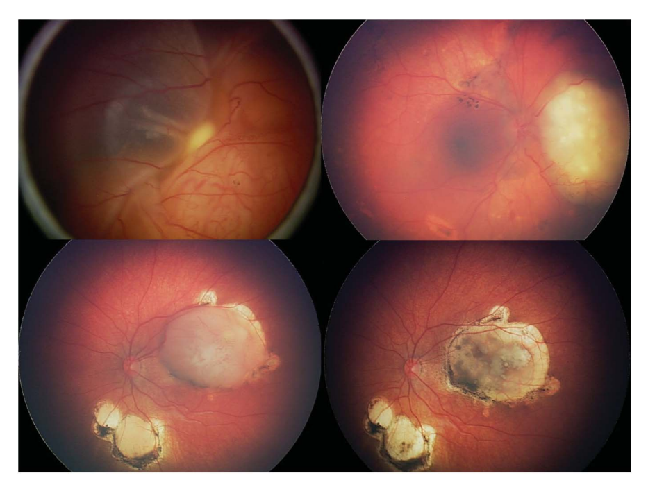
Figure 2 IAC for retinoblastoma. (a, b) Primary IAC showing before (a) and after (b) three cycles of melphalan. (c, d) Secondary IAC following IVC but with recurrence of macular and inferior tumours (c) that responded completely (d) to three cycles of melphalan.

method of IAC has been described by Kaneko et al<sup>27</sup> and later refined by Gobin et al<sup>50</sup> and Abramson et al.<sup>28</sup> Shields and Shields<sup>19</sup> published a four-decade perspective of retinoblastoma therapy on various treatments that have been popular and later abandoned, issuing caution with new therapies until proper assessment of limitations are realized. In a 4-year perspective, Gobin et al<sup>50</sup> found IAC safe and effective for treatment of retinoblastoma with successful catheterization in 98% of procedures with ocular survival at 2 years in 82% if IAC was primary treatment and 58% if secondary treatment. Shields et al<sup>30</sup> found primary therapy with IAC successful in 100% of group C, 100% of group D and 33% of group E eyes (Figure 2). Muen et al <sup>51</sup> reported secondary IAC for eyes that failed previous systemic IVC or local therapy and found 80% control (Figure 3). Shields et al<sup>52</sup> found 'minimal exposure IAC', using only one or two doses of IAC remarkably effective for select group C and less-advanced group D eyes. Eyes with retinal detachment from retinoblastoma show complete resolution of detachment following IAC if the detachment is partial and complete reattachment in most of those with total detachment.<sup>5</sup>