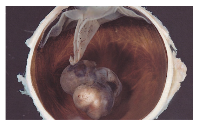
Figure 1. An example of uveal melanoma: a variably pigmented, mushroom-shaped choroidal tumor that has ruptured the Bruch membrane and grown into the subretinal space.

If uveal melanoma is suspected, patients undergo a detailed work-up including ultrasound to assess the size of the lesion, optical coherence tomography for detection of subretinal fluid, autofluorescence to allow for orange pigment